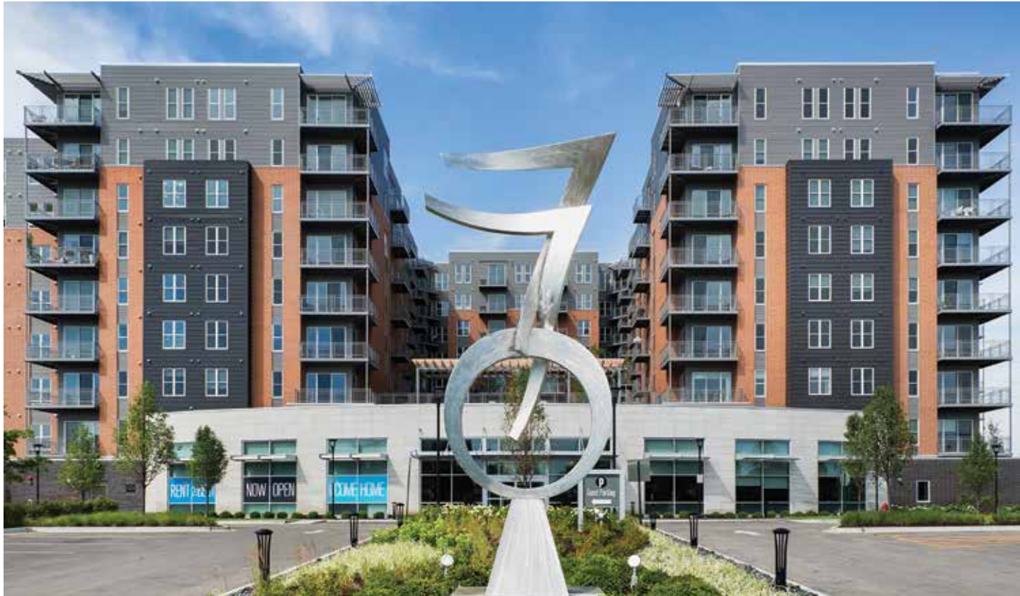
NorthShore 770 and Morningside Construction Managers