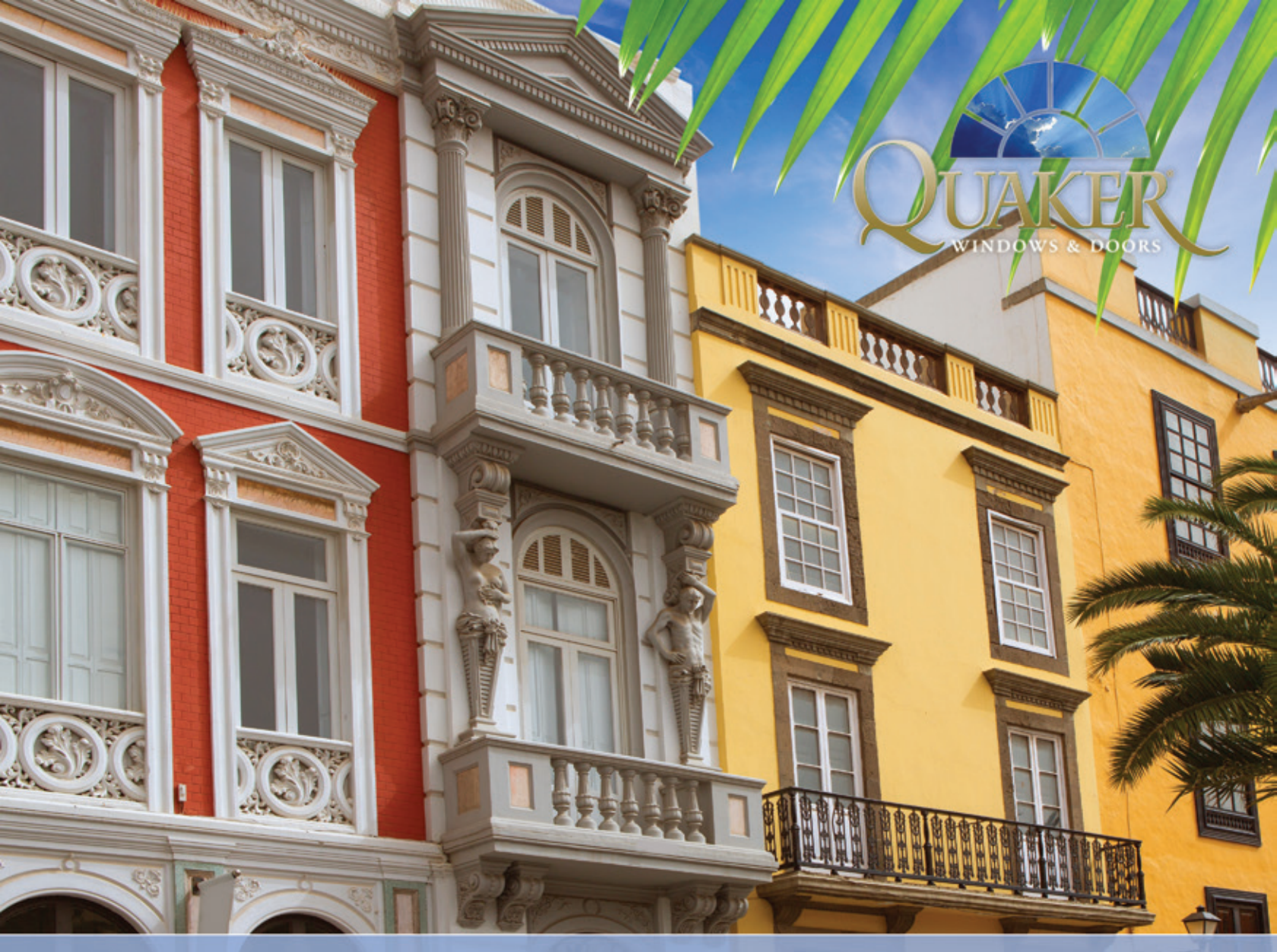
Specifically designed to meet demanding DP-50 requirements for wind load and water infiltration.